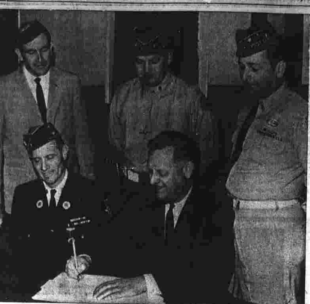
Next Week Hire a Vet Week